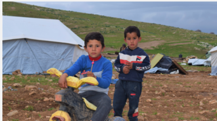
Displaced children in Humsa - Al Bqai'a on 4 February 2021.

For more on the general and legal background, please see Flash Update #1 .