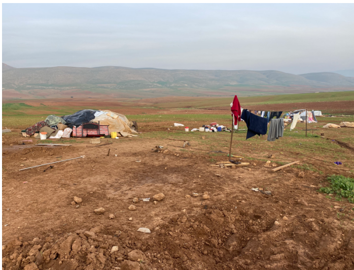
Scattered personal belongings, following further demolitions, Humsa Al Bqai'a, 8 February 2021